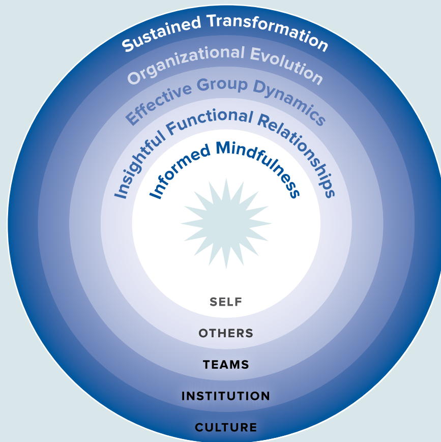
The Five Domains of Integrative Leadership

Such cultural evolution leads, inevitably, to a sustained transformation.